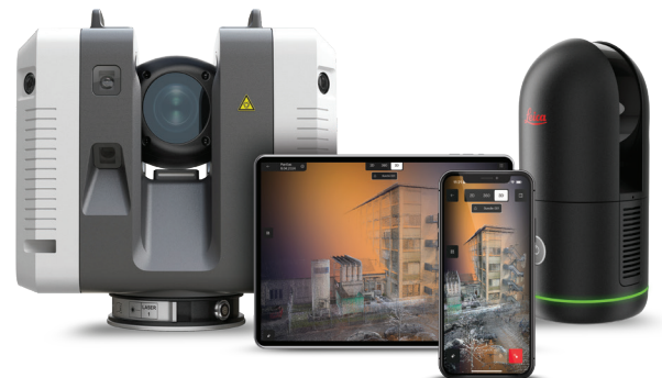
Leica RTC360 3D laser scanner with the Leica BLK360 imaging laser scanner and Leica Cyclone FIELD 360 mobile-device app.