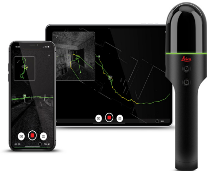
Leica BLK2GO handheld imaging laser scanner and Leica Cyclone FIELD 360 mobile-device app.

Download from Google Play Store and Apple App Store.